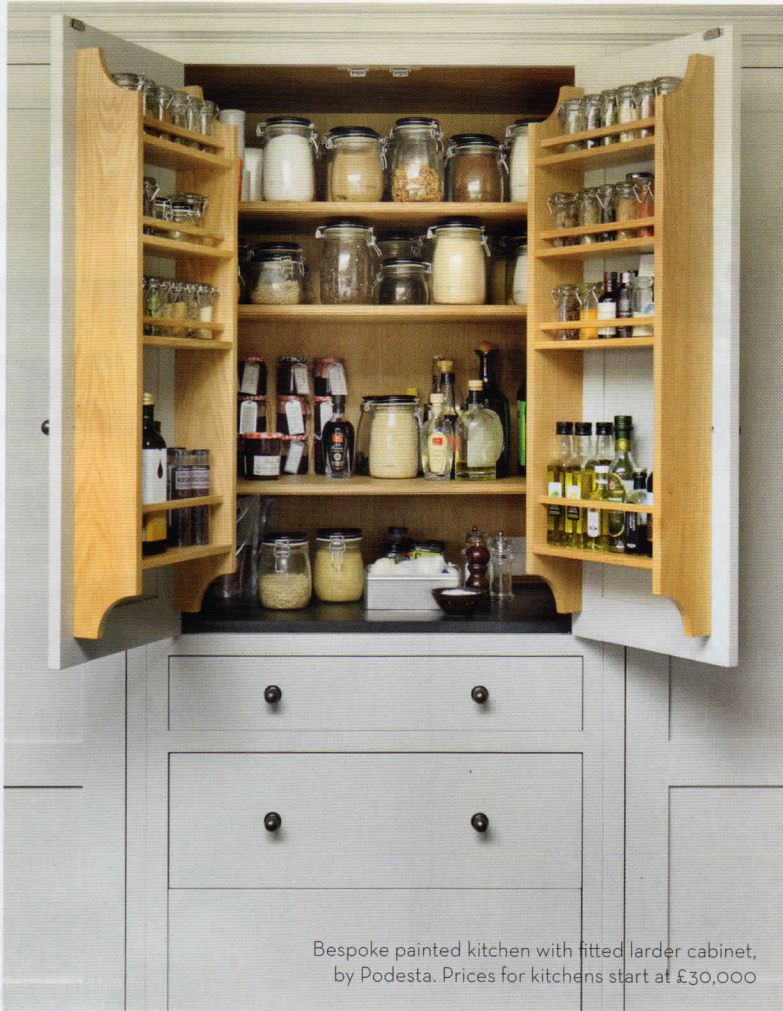
Bespoke painted kitchen with fitted larder cabinet, by Podesta. Prices for kitchens start at £30,000